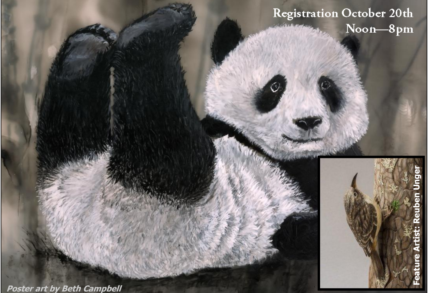
Poster art by Beth Campbell